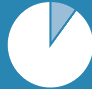
Quartile 4 - Highest Pay